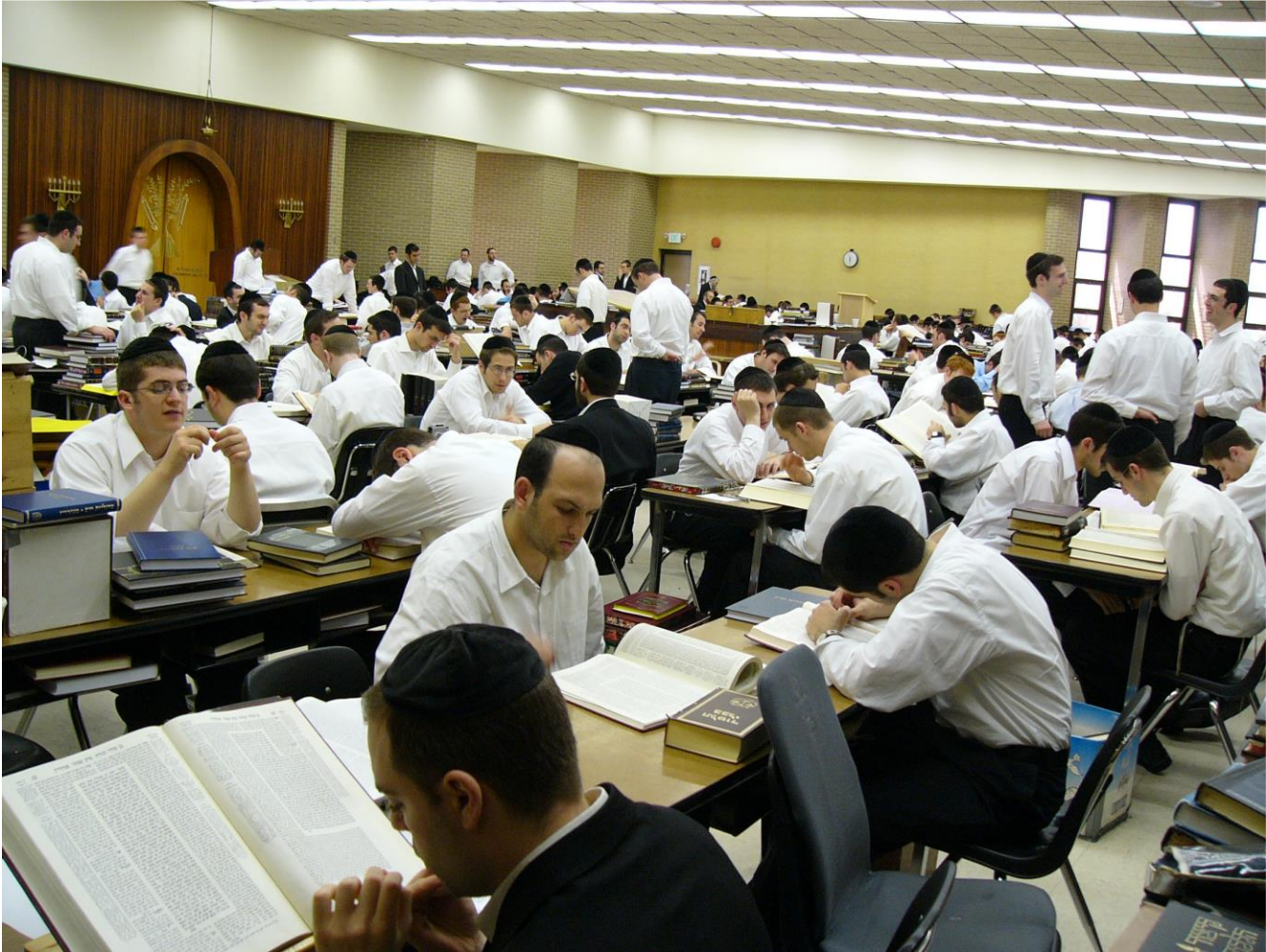
Tanenbaum Bais Hamedrash

Decisions regarding transfer credits are subject to the same appeals process described below (page 33).