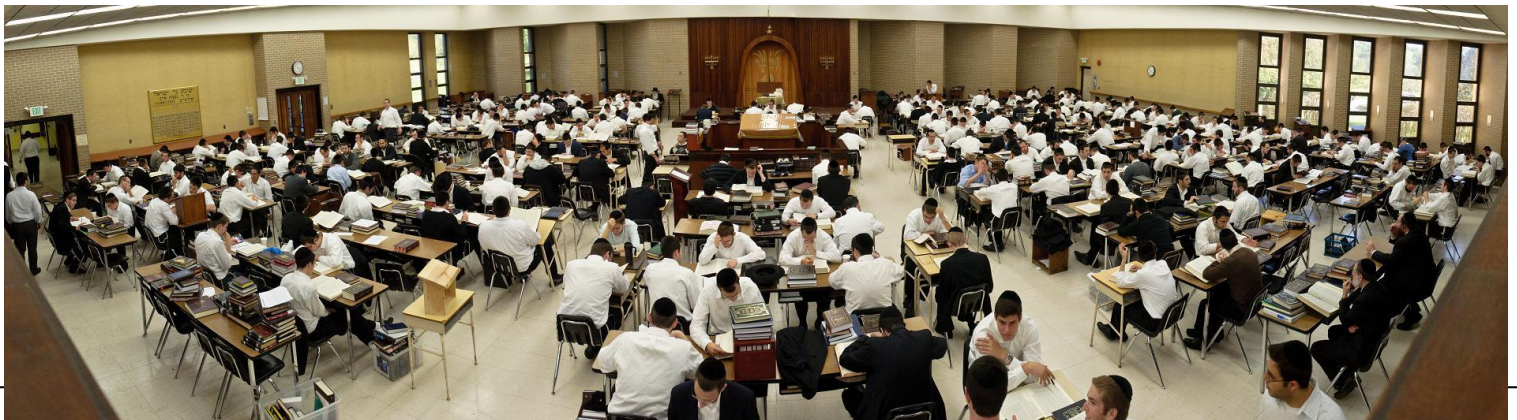
Panoramic view of the Bais Medrash

A candidate for this degree will be required to complete a minimum of 60 credits at Ner Israel. In all cases, the last semester must be completed at this institution.